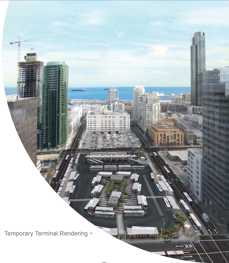
Temporary Terminal Rendering +

The Transbay Joint Powers Authority (TJPA) continues to make exciting progress toward building the Transbay Transit Center, the “Grand Central Station of the West.” Ground-breaking commenced in December 2008 for the Temporary Terminal that will serve bus passengers while the new Transit Center is under construction.