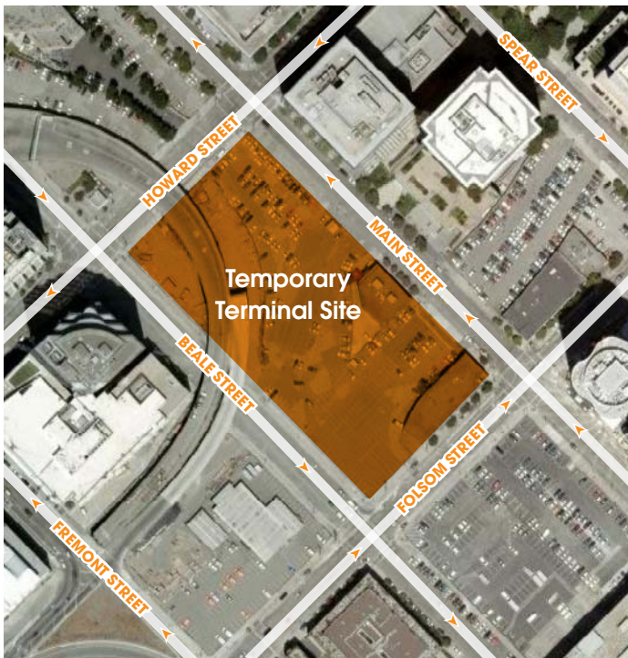
Map of Project Area +