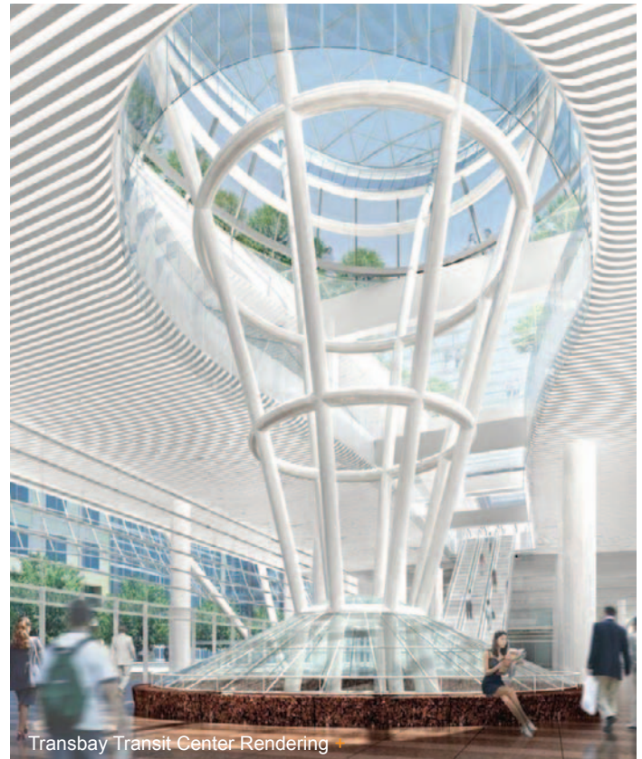
Transbay Transit Center Rendering +