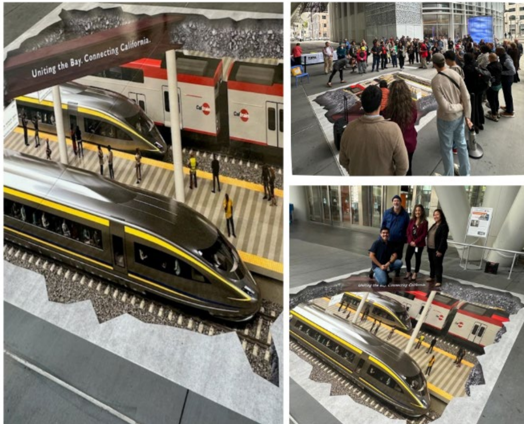
Photos: Decal Unveiling with Transit Enthusiasts and Partners.

California High-Speed Rail Authority and transit enthusiasts outside the doors of the Transit Center's Grand Hall. This installation highlights The Portal by offering a 60-foot view below ground into the future high-speed rail platform, which will connect Caltrain and the statewide high-speed rail system to downtown San Francisco, allowing travel to Los Angeles in under three hours. Swing by and check it out! Snap a pic, strike a pose, or soak it in—don't forget to share your experience on social media and tag us.