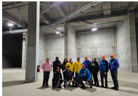
Photos [Left to Right]: Federal and State Delegation, August and East Cut Community Benefit District, December.