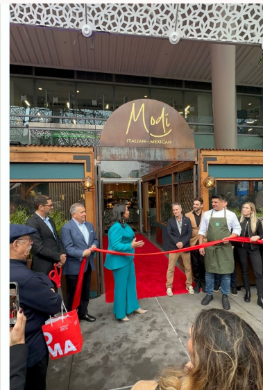
Photos [Left to Right]: Inaugural Harvest Fest, October; Sixth Birthday Poster for Salesforce Transit Center, August; and Modi grand opening, November.

In 2024, we welcomed back the Shoeshine Guild to our Transit Center’s Grand Hall and introduced a fresh twist on Italian and Mexican cuisine with the arrival of the Modi restaurant on the Natoma Street side of the Transit Center. In 2025, we look forward to welcoming Dim Baos and Juice Bar alongside a new Barebottle location in our Grand Hall. As return-to-work trends and ridership at the Transit Center continue to grow with a 22% year-over-year increase and daily visits peaking at 150,000, we’re on track to exceed 1 million visits at the Transit Center by end of year.