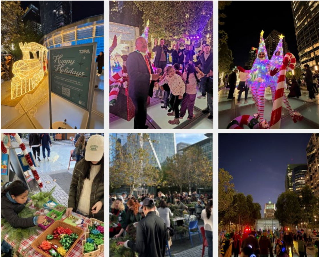
December 6-8, Winterfest, a Three-day Weekend of Fun for Everyone.

It was great to celebrate this holiday season with so many of you at our annual Salesforce Park holiday lighting that kicked off the 5th Annual Winterfest weekend activities, which brought over 1,700 people.