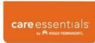
Care Essentials by Kaiser Permanente