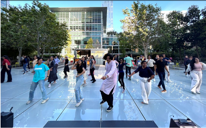
Bollywood Nights - May 31, 2024