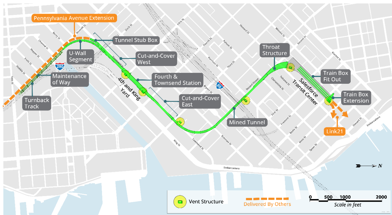
Figure 1. The Portal Main Components

The Portal alignment (shown in Figure 1) begins at the east end of the Center’s below-grade rail station at Beale and Minna streets. At the west end of the station, the station’s six tracks transition to two tracks, bearing west through a throat structure and then continuing southward in a tunnel under Second Street and westward under Townsend Street to a new underground station at Fourth and Townsend streets. West of the station, near Seventh and Townsend streets, the tracks then ascend to grade via a u-shaped retained cut (referred to as the “u-wall”), then southward at-grade to 16th Street, south of the existing Caltrain terminal station and 4th and King Yard. A tunnel stub box extends side-by-side with the u-wall to allow for a connection to the future Pennsylvania Avenue Extension—a concept being explored by the San Francisco County Transportation Authority that would grade-separate the rail alignment from 16th Street and Mission Bay Drive, which are surface streets farther south of The Portal.