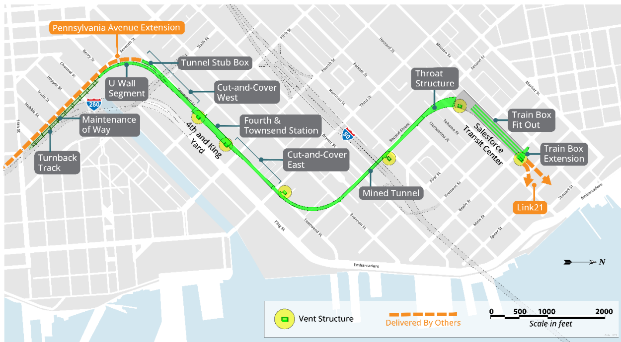
Figure 1. The Portal Main Components

The Portal alignment (shown in Figure 1) begins at the east end of the Center’s below-grade rail station at Beale and Minna streets. At the west end of the station, the station’s six tracks transition to two tracks, bearing west through a throat structure and then continuing southward in a tunnel under Second Street and westward under Townsend Street to a new underground station at Fourth and Townsend streets. West of the station, near Seventh and Townsend streets, the tracks then ascend to grade via a u-shaped retained cut (referred to as the “u-wall”), then southward at-grade to 16th Street, south of the existing Caltrain terminal station and 4th and King Yard. A tunnel stub box extends side-by-side with the u-wall to allow for a connection to the future Pennsylvania Avenue Extension—a concept being explored by the San Francisco County Transportation Authority that would grade-separate the rail alignment from 16th Street and Mission Bay Drive, which are surface streets farther south of The Portal.