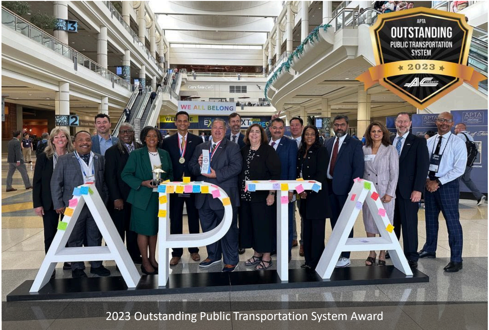
2023 Outstanding Public Transportation System Award