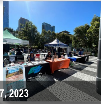
Let's Talk Transit – September 27, 2023