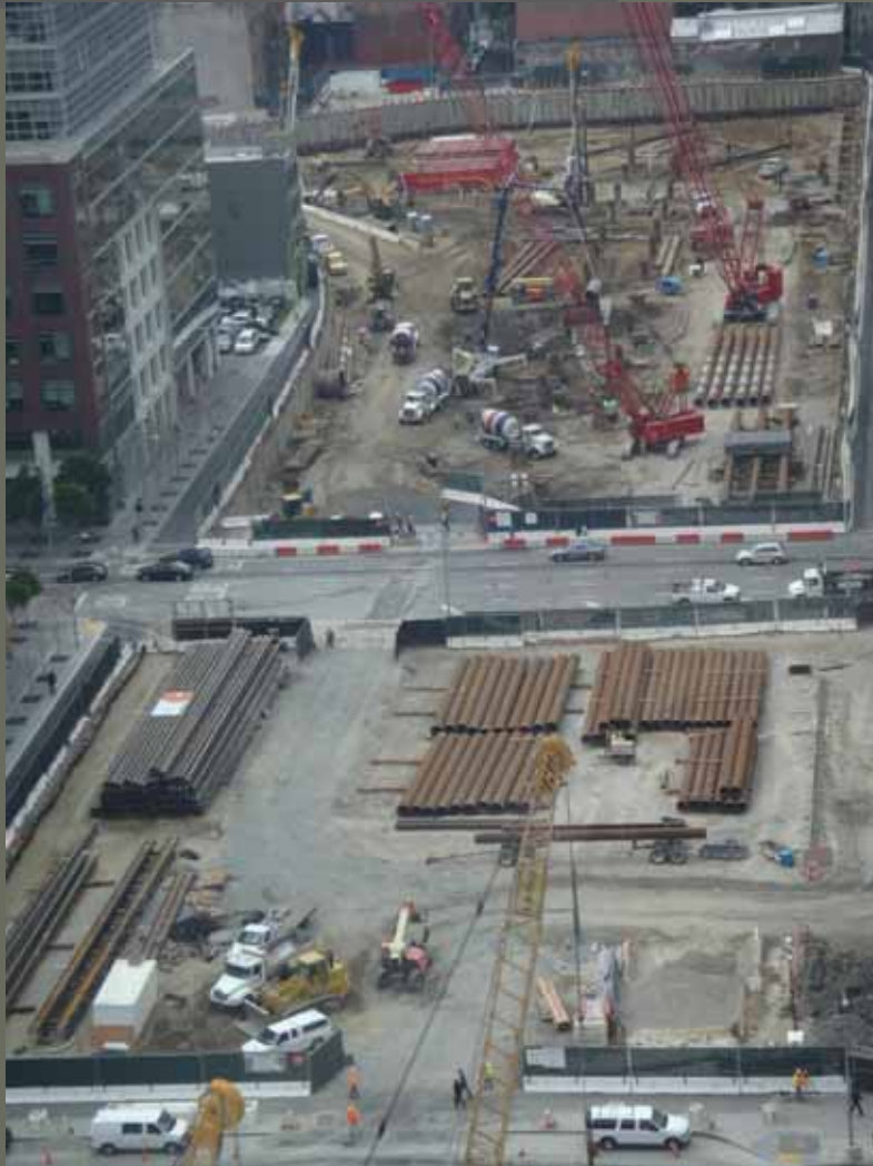
End of February 2012