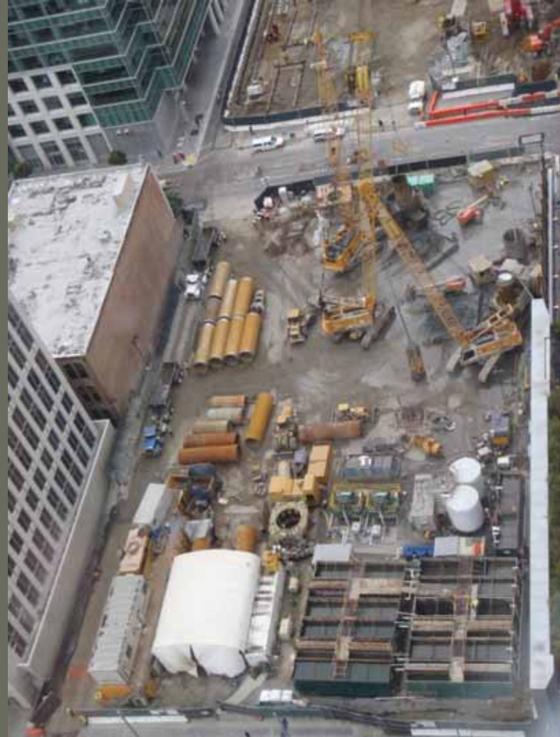
End of March 2012