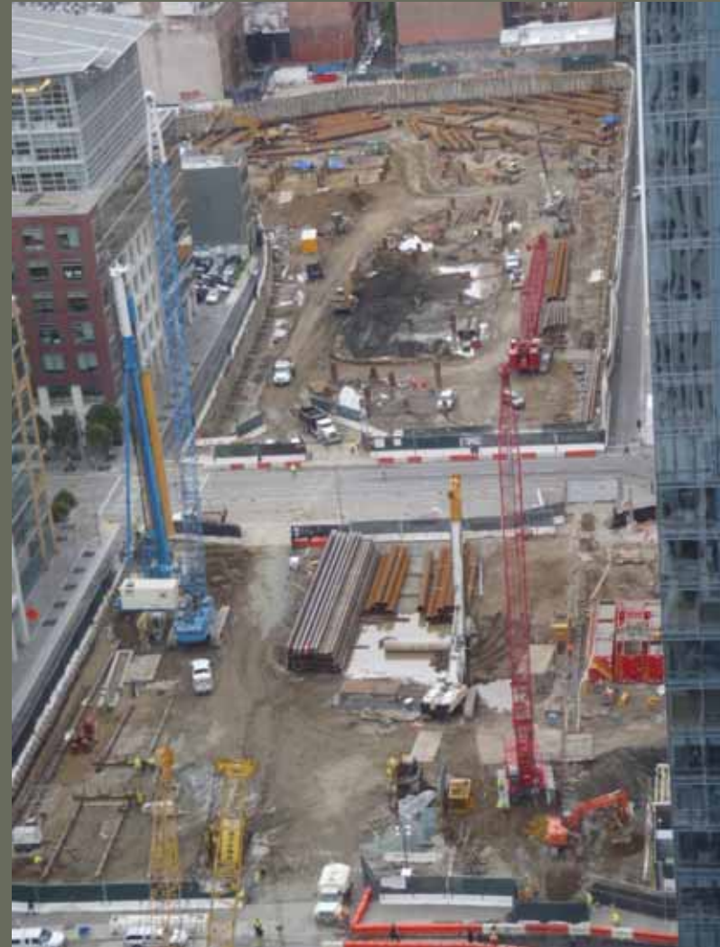
End of March 2012