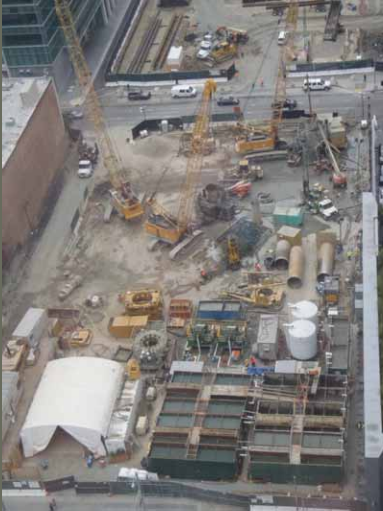
End of February 2012