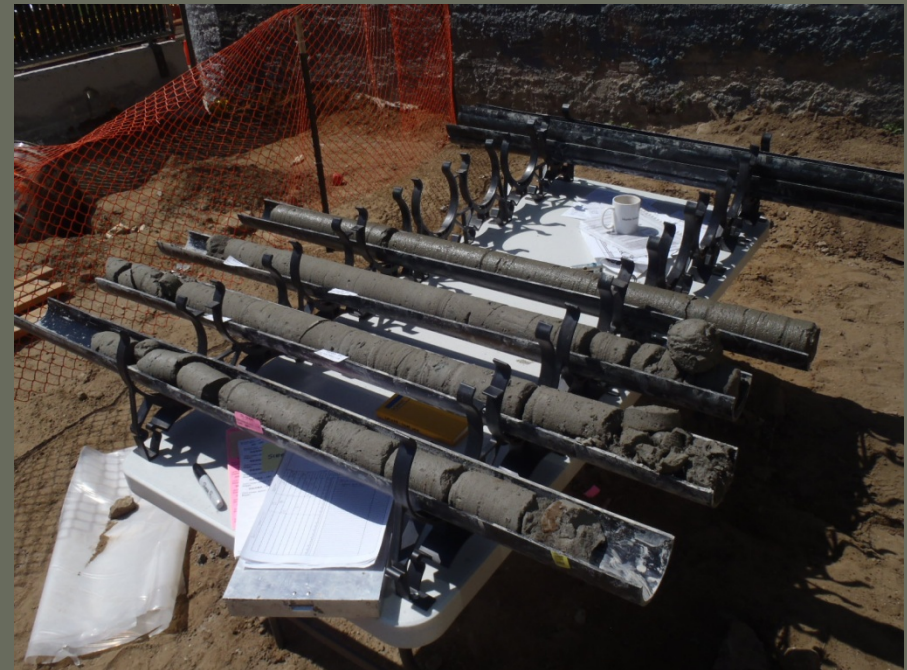
CDSM Shoring Wall Cores