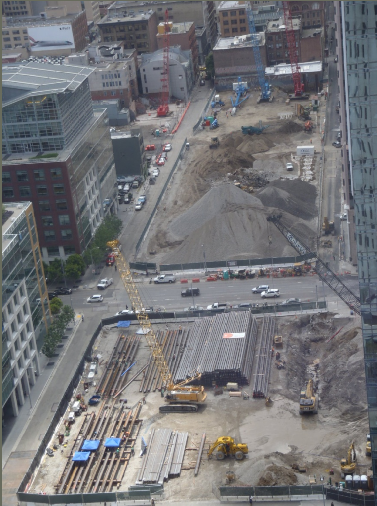
End of June 2011