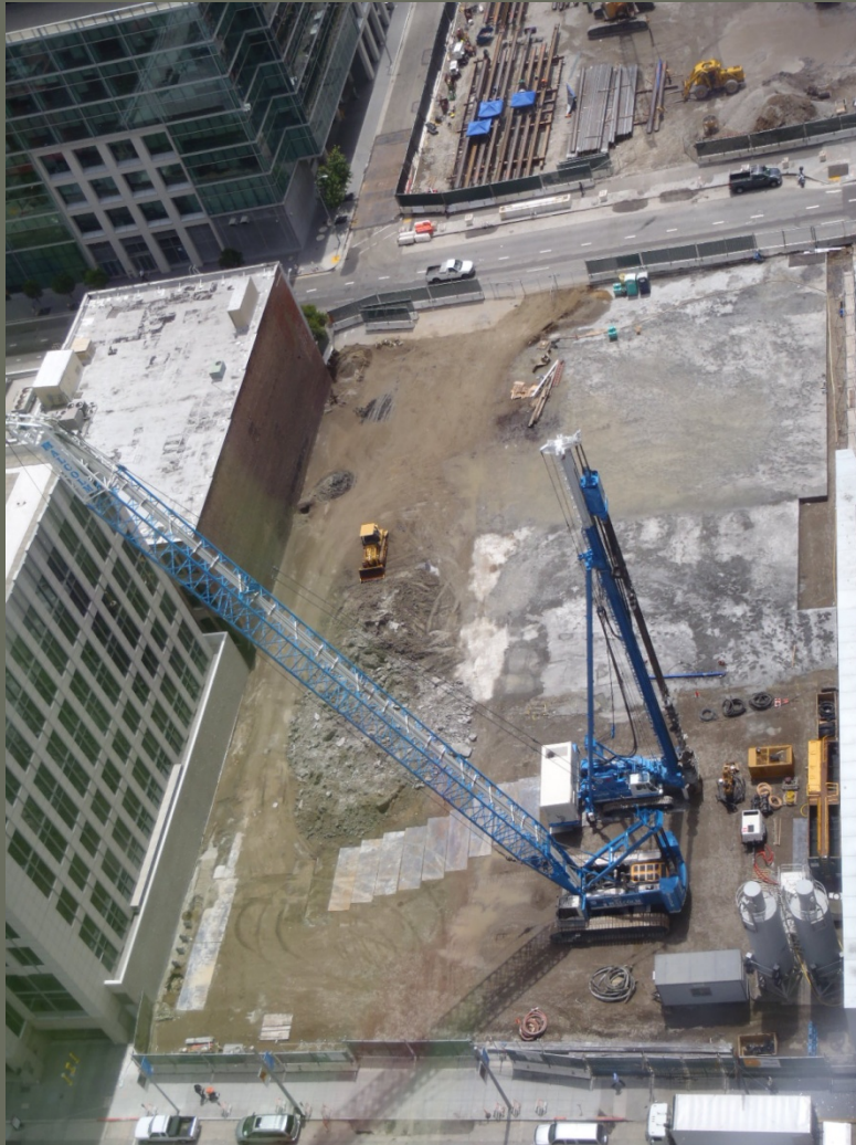
End of June 2011