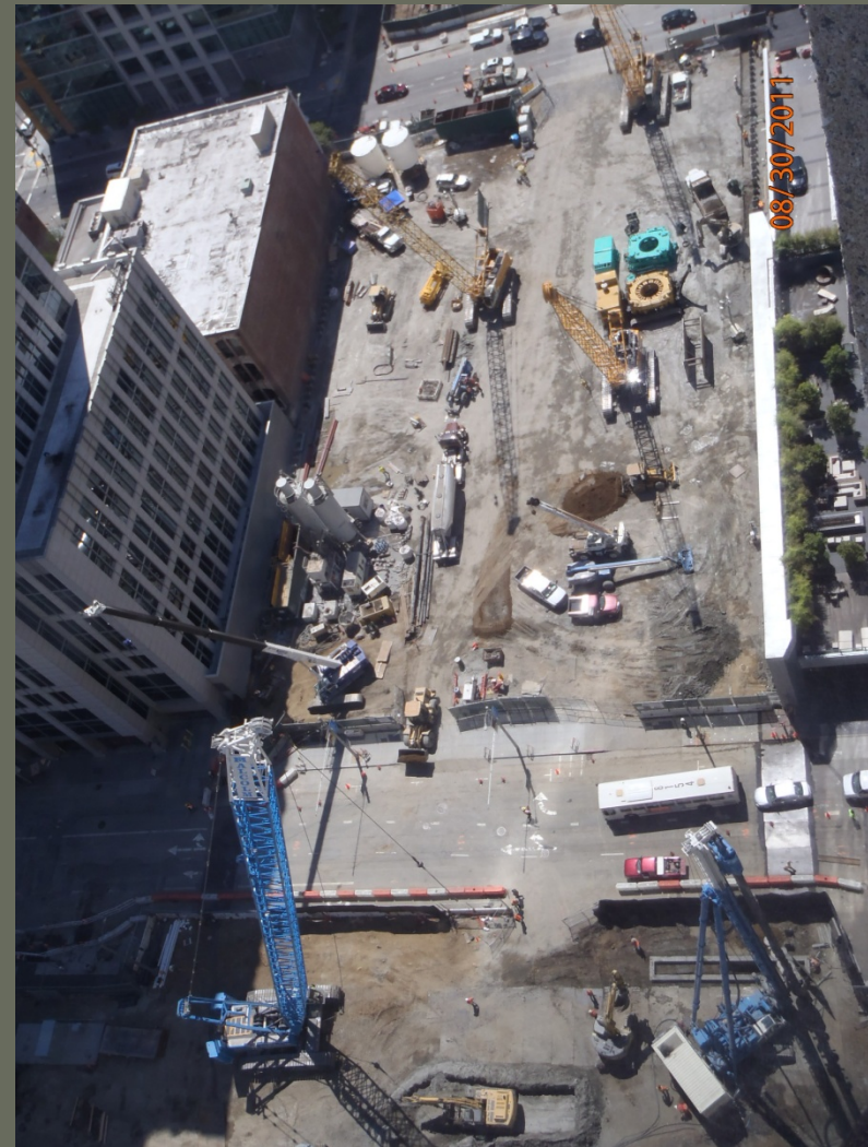
End of August 2011