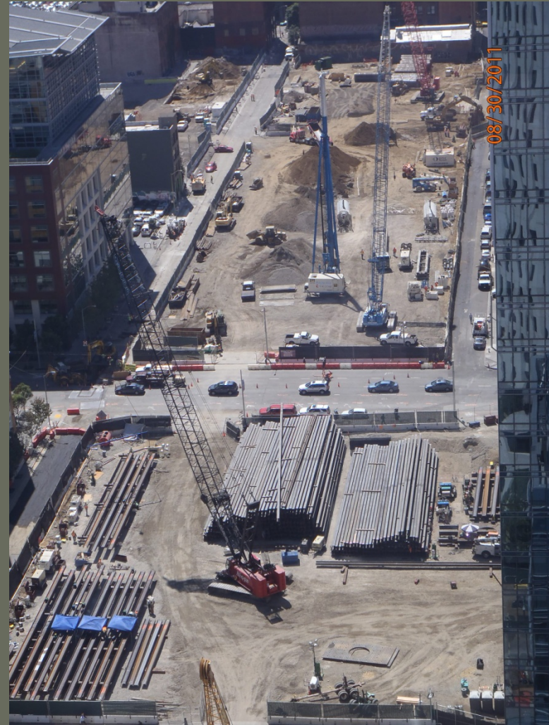
End of August 2011