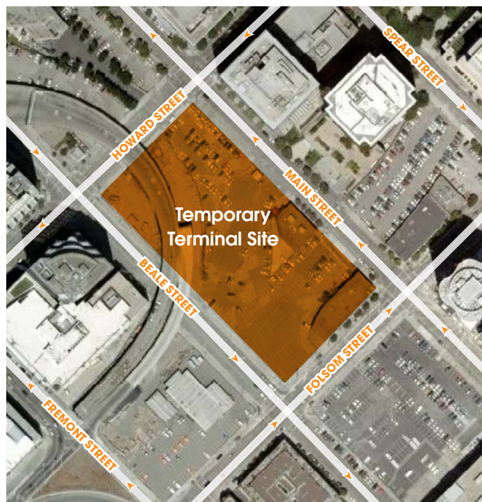
Map of Project Area +

The Transbay Joint Powers Authority (TJPA) continues to make exciting progress toward building the Transbay Transit Center, the “Grand Central Station of the West.” Ground-breaking commenced in December 2008 for the Temporary Terminal that will serve bus passengers while the new Transit Center is under construction.