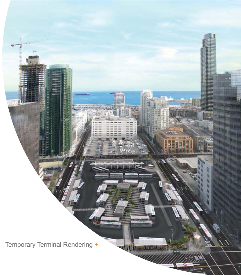
Temporary Terminal Rendering +