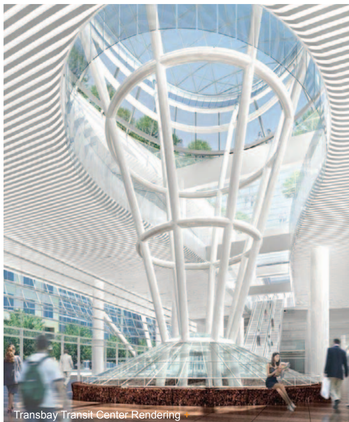
Transbay Transit Center Rendering +