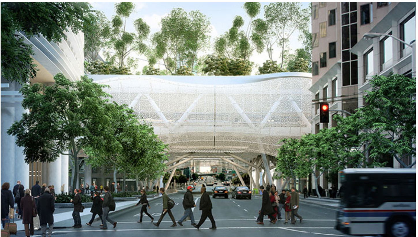
Rendering of the new Salesforce Transit Center at First Street, looking south.

The TJPA Board of Directors has approved a naming and signage rights agreement with salesforce.com, the San Francisco-based cloud computing company. This unique and exciting public-private partnership will generate more than $110 million over a 25-year