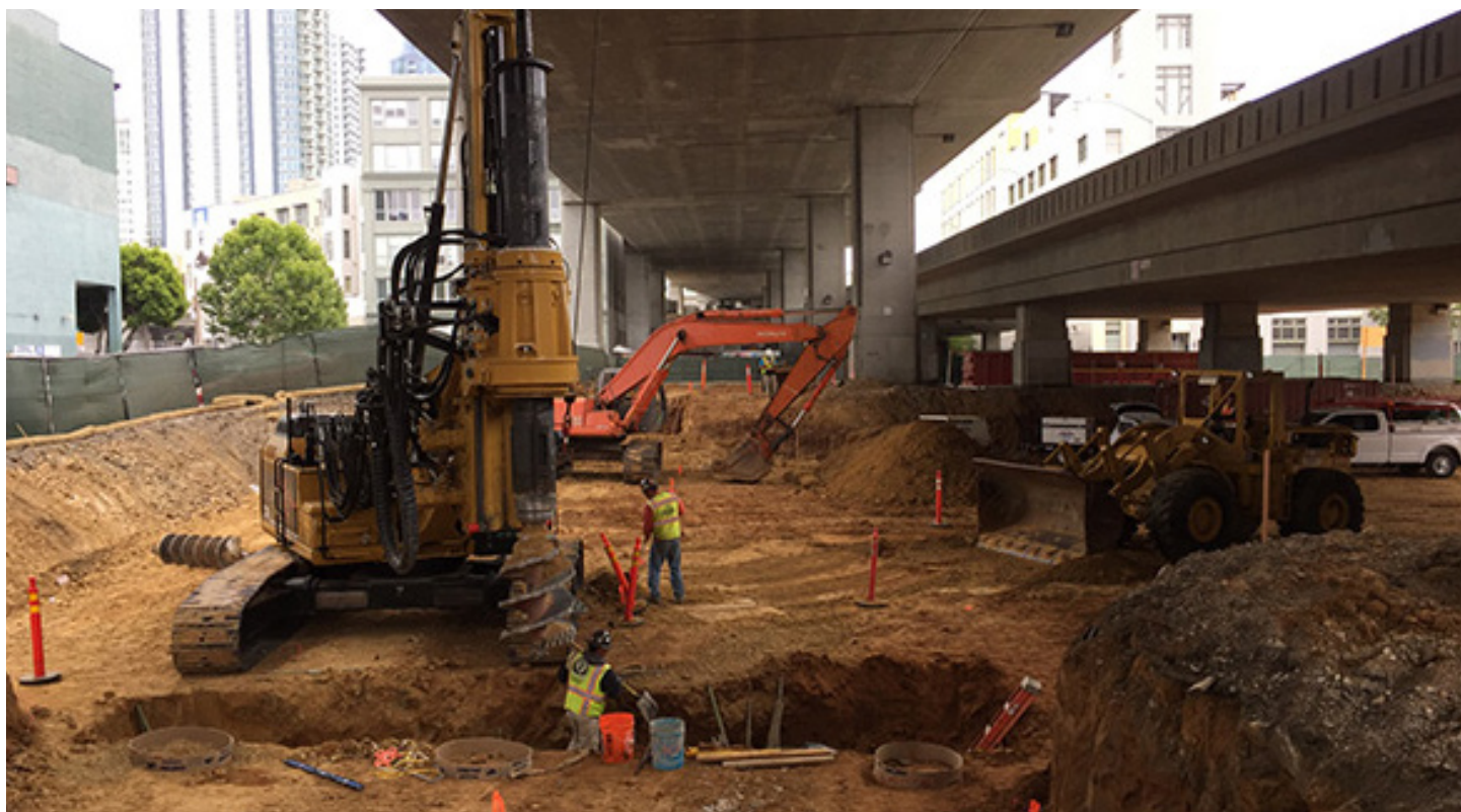
The bus storage site is located between Second, Third, Perry and Stillman streets. Excavation (shown above) began in June.

Contractor Ghilotti Construction Company won the contract to construct the bus storage facility and is expected to complete the project in mid-2018.