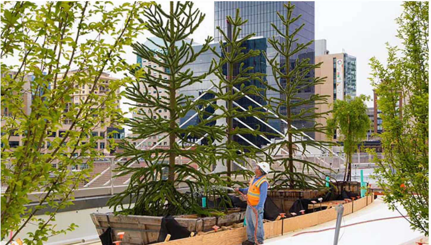
The three monkey puzzle trees above are part of the Chilean garden, one of thirteen themed gardens around the perimeter of the park.

The largest trees have been arriving on the project site intermittently since January, as installation of the rooftop drainage, piping, and electrical systems is completed. Working at night, crews hoist the crated trees up to the park using a 35-ton crane to place them in their final location. The trees remain in their crates and are supported in place until the park's subsurface material, including geosynthetic fill and soil, is built up around them.