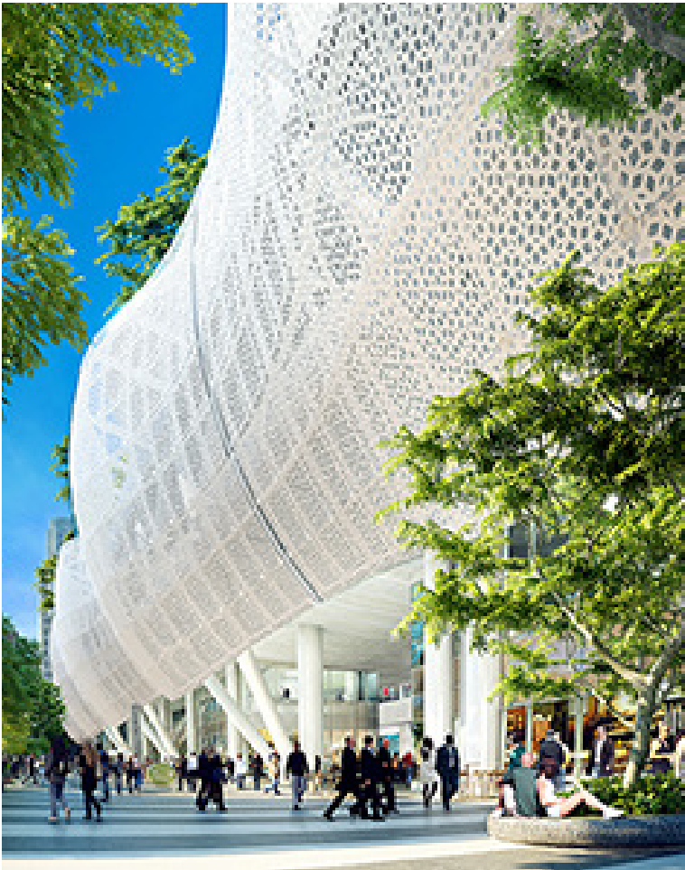
Rendering of the new Salesforce Transit Center at Natoma Street.

term to operate and maintain a safe, clean and inviting public transit center.