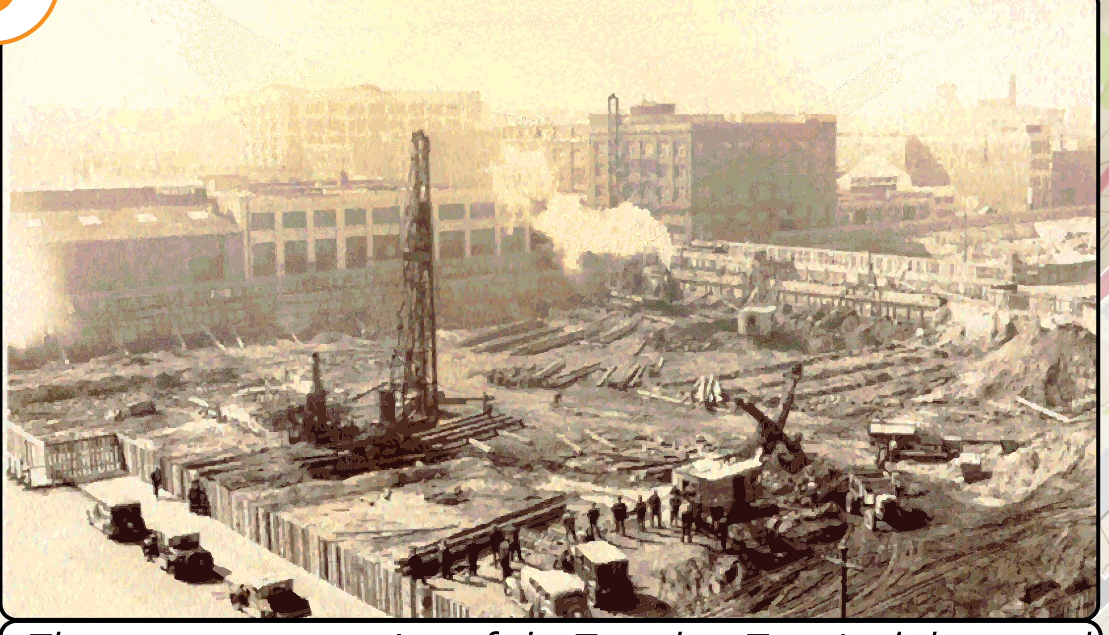
The 1930s construction of the Transbay Terminal destroyed whatever evidence existed of earlier activities that occurred in the central part of the project area.