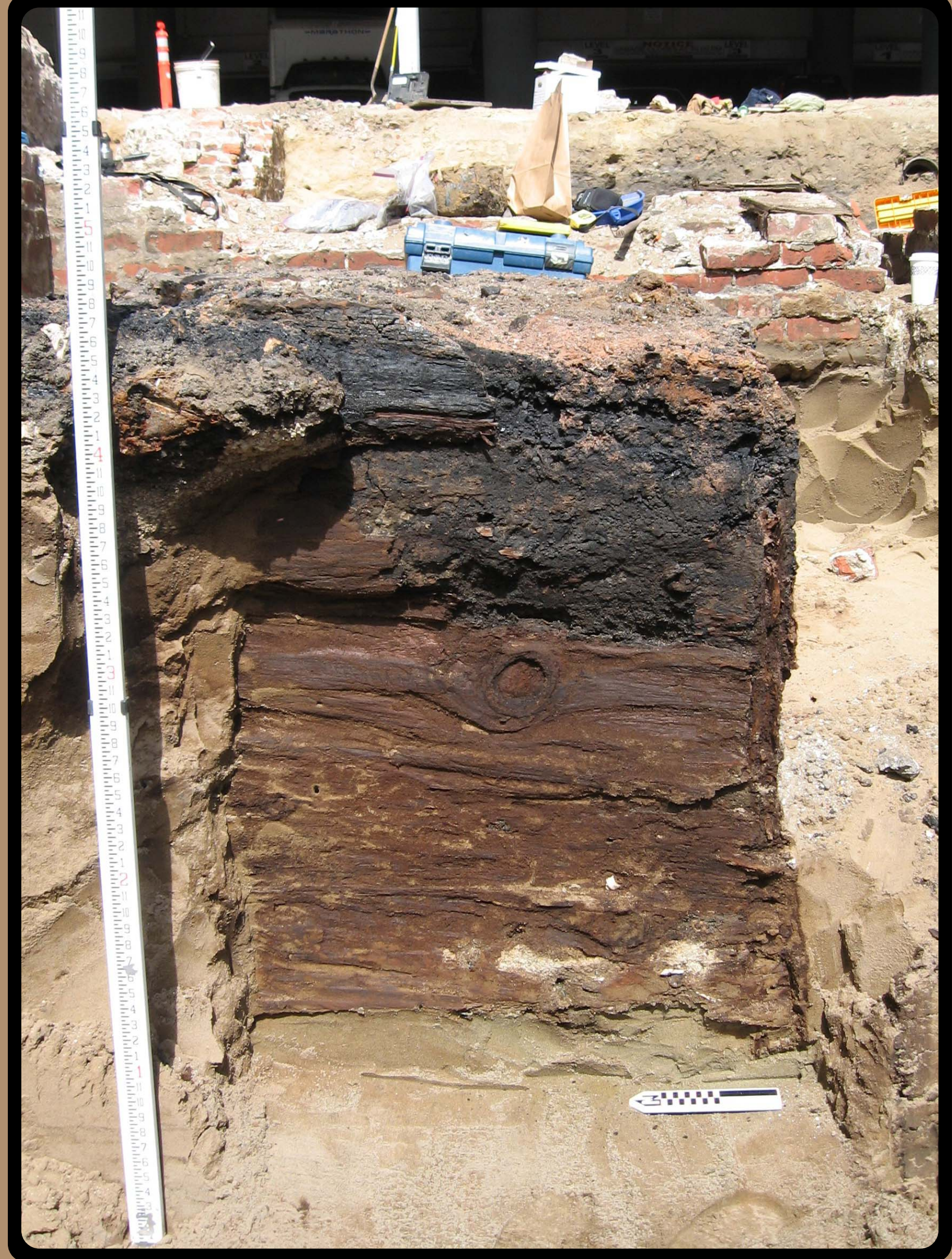
This privy was encountered below the modern ground surface and its contents were excavated by archaeologists.