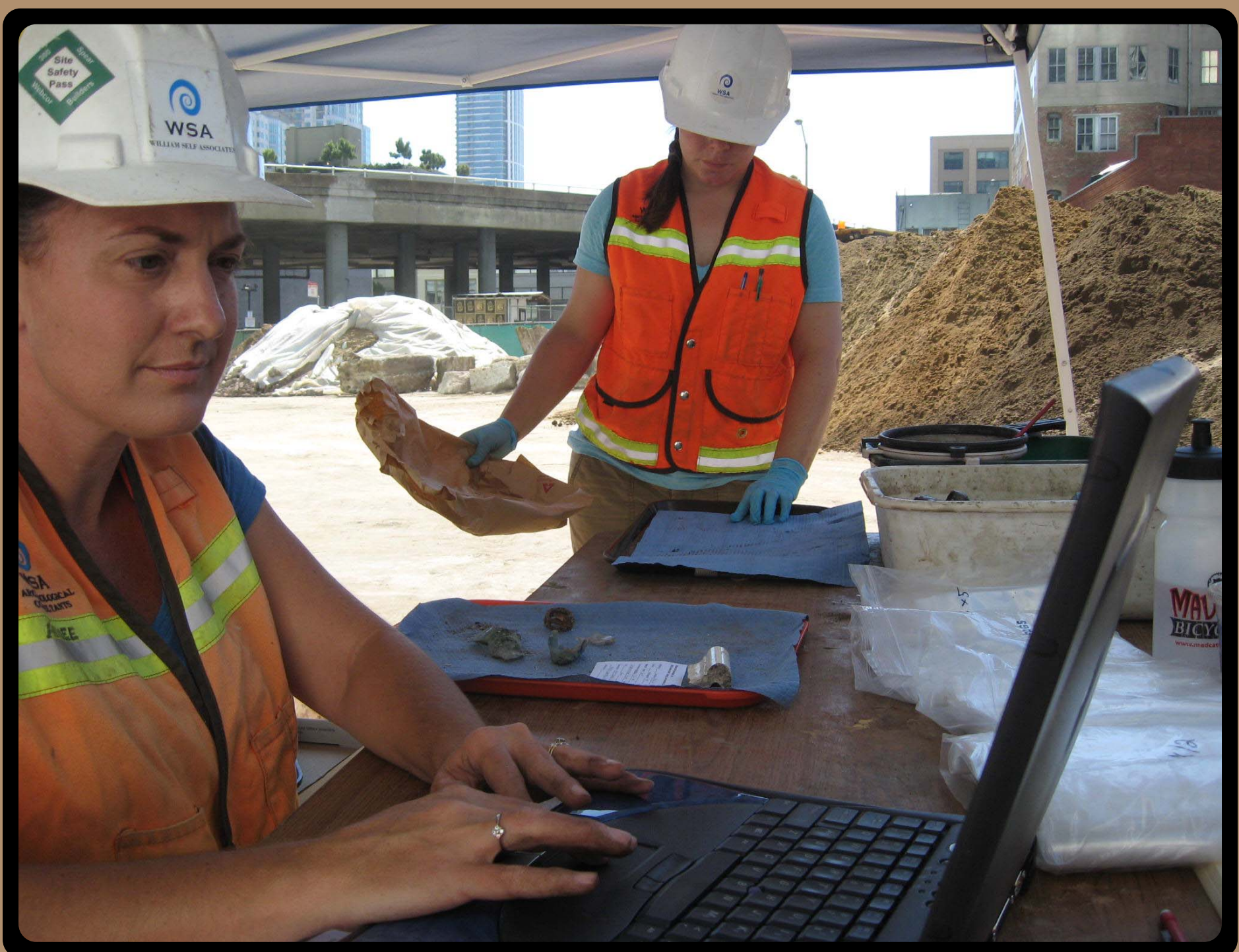
Archaeologists wash and catalog artifacts in the field before transporting them to the lab for analysis.