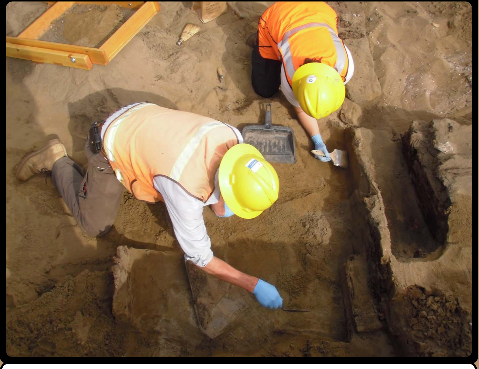
Archaeologists investigate a redwood drain. These were typically used to convey water in 19th-century San Francisco.