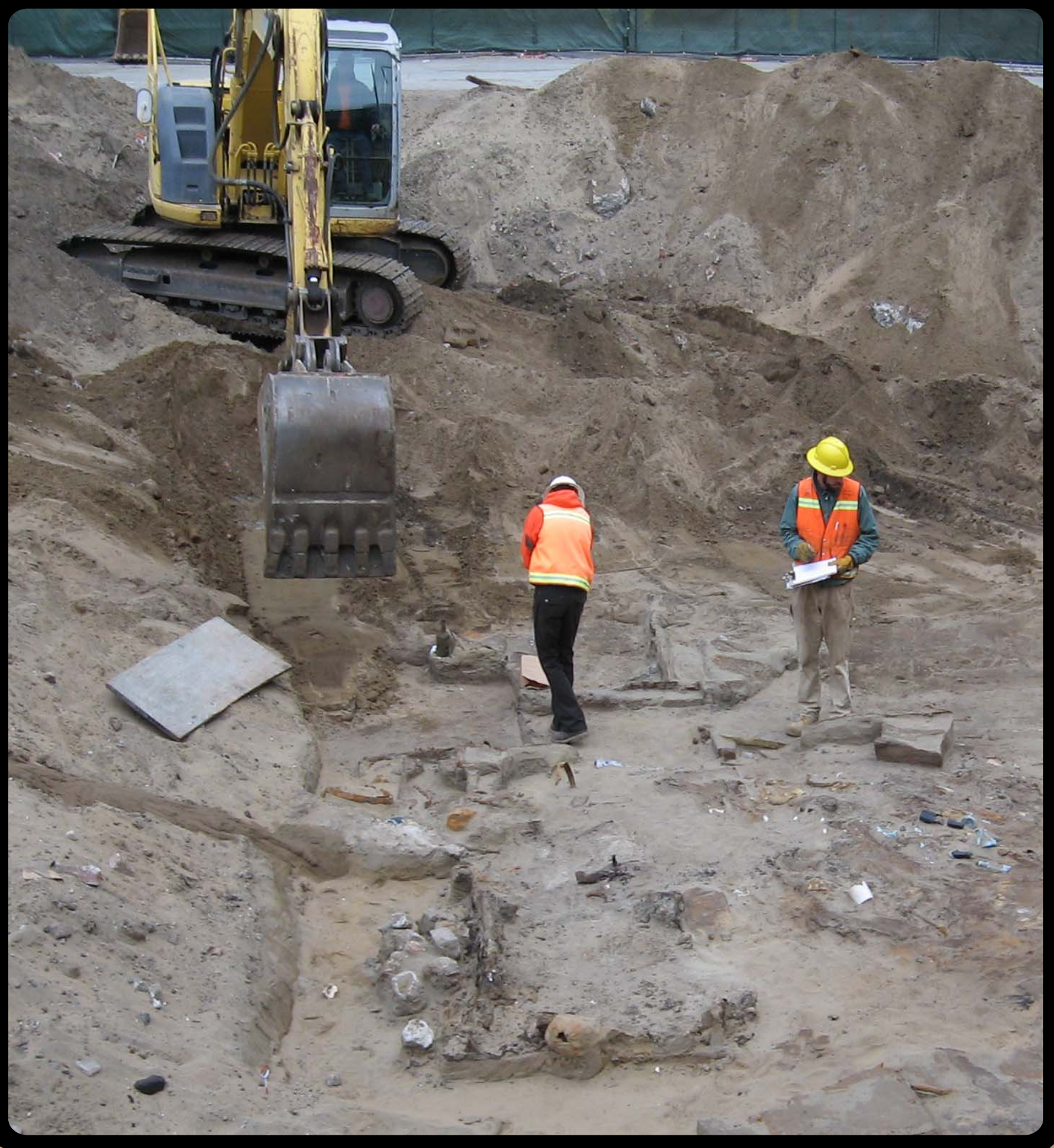
In addition to photographing features found during testing, archaeologists complete drawings to scale.