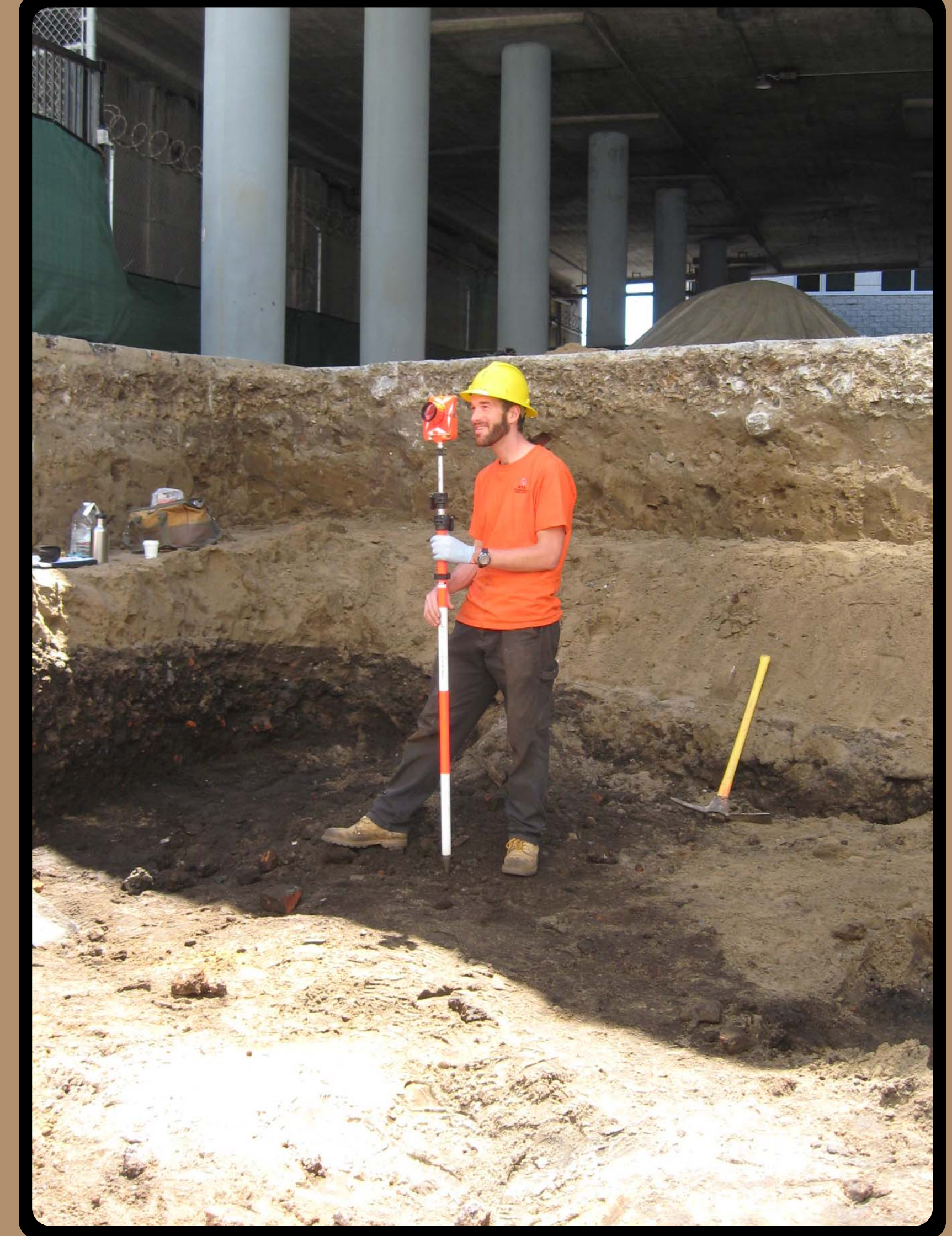
Accurately documenting the location and depth of archaeological findings is essential to understanding the history of the city.