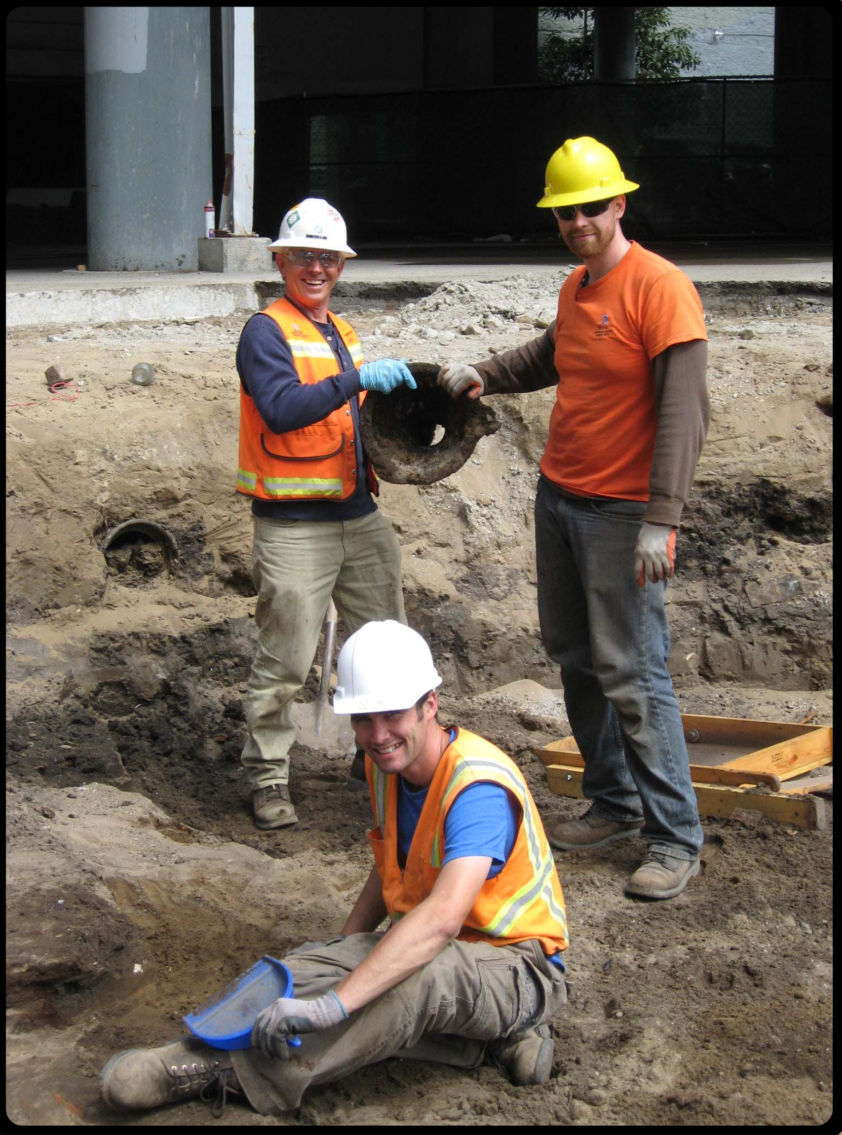
Archaeologists retrieve a cast-iron toilet, found during privy excavation.