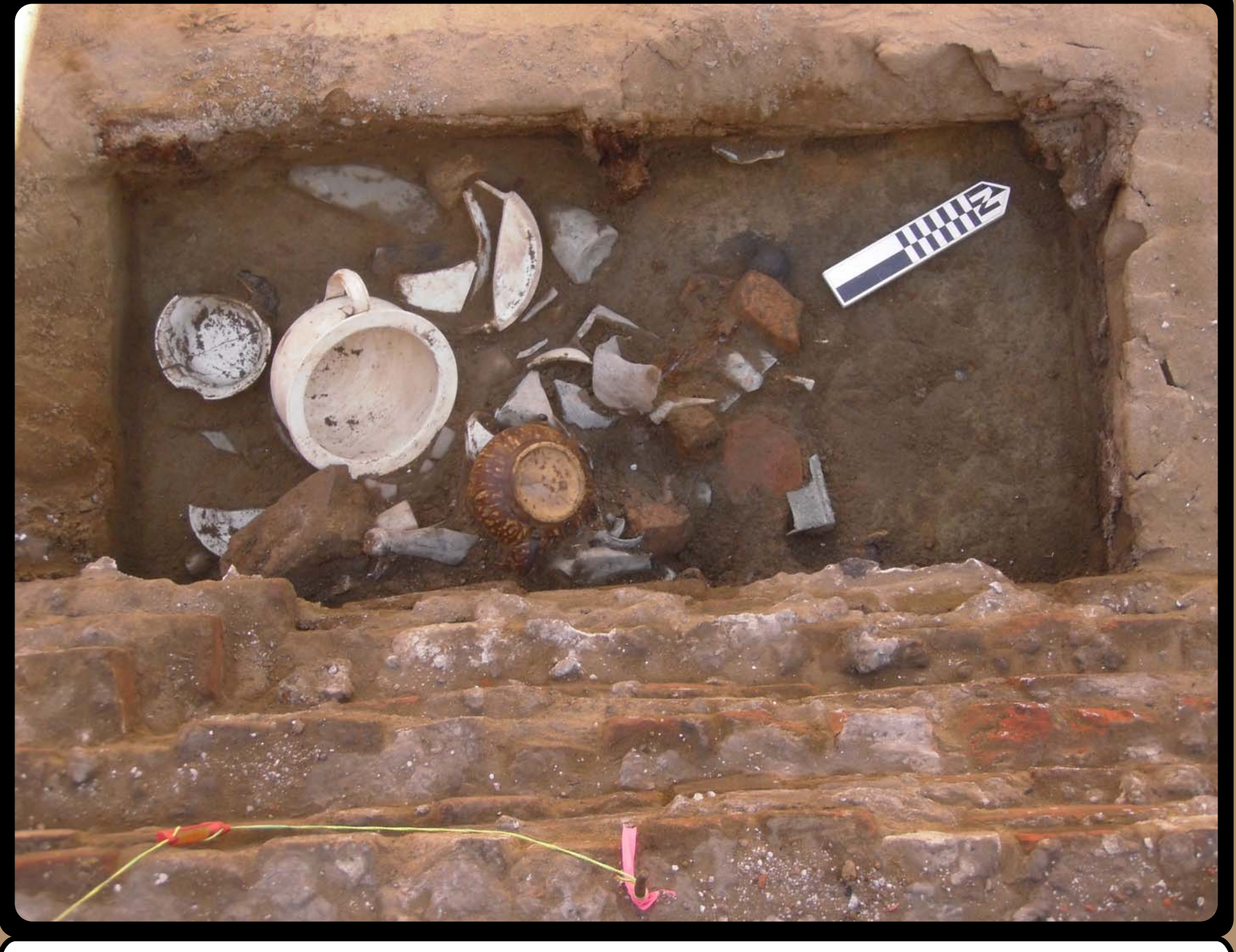
Privies like the one seen here were also commonly used as receptacles for household items. After it was abandoned, this privy was impacted by a brick foundation wall built to support a later building.