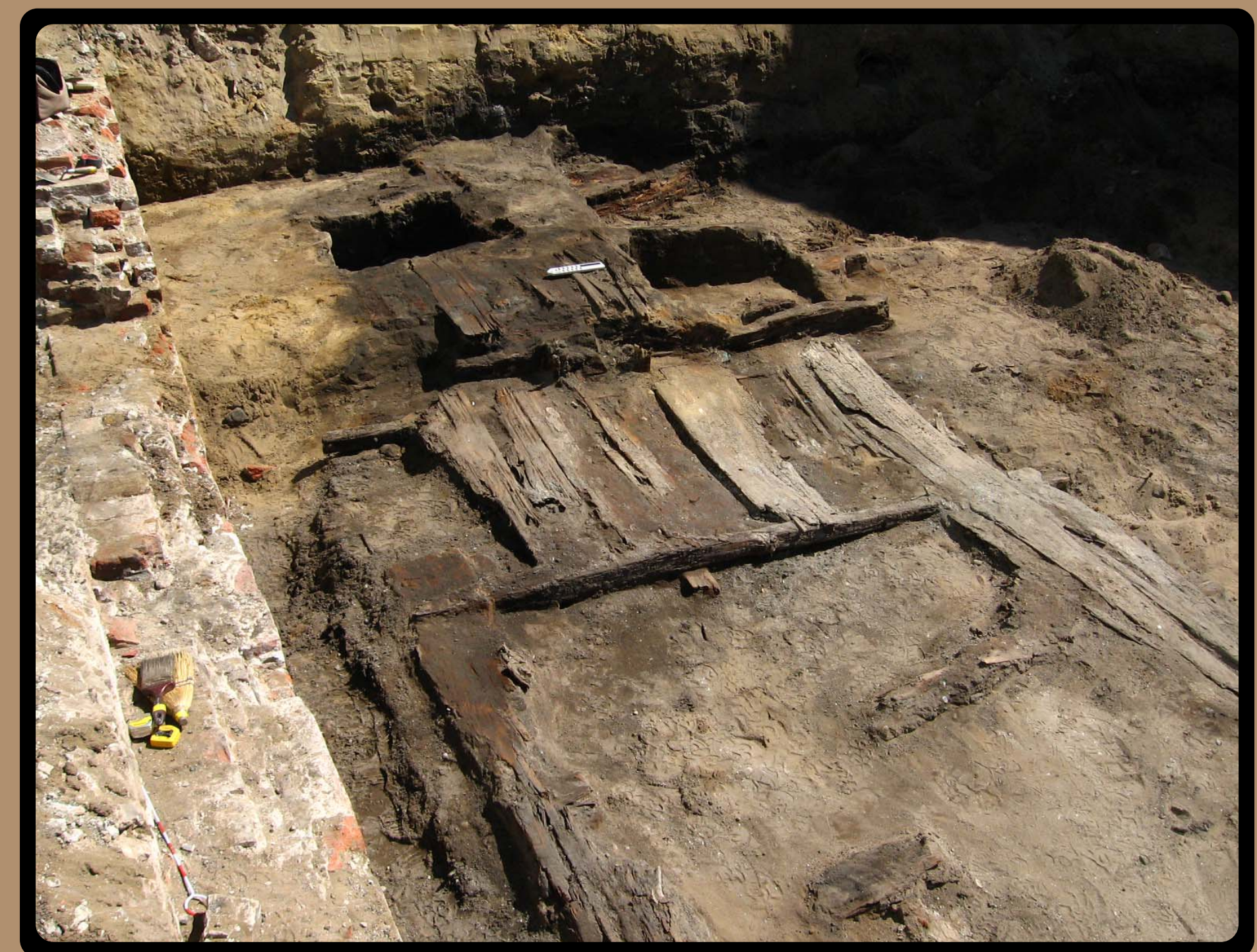
Remnants of wood planks depict the footprint of a small 19th-century structure.