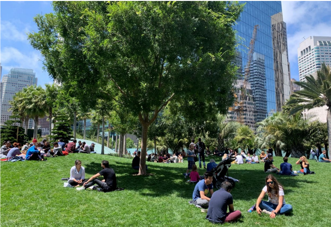
The Loop Path

The gardens of Salesforce Park showcase a wide variety of plants that grow in California's Mediterranean climate as well as the diversity of plants from several of the world's other Mediterranean climate zones. Each of those zones, from Mediterranean Europe to western