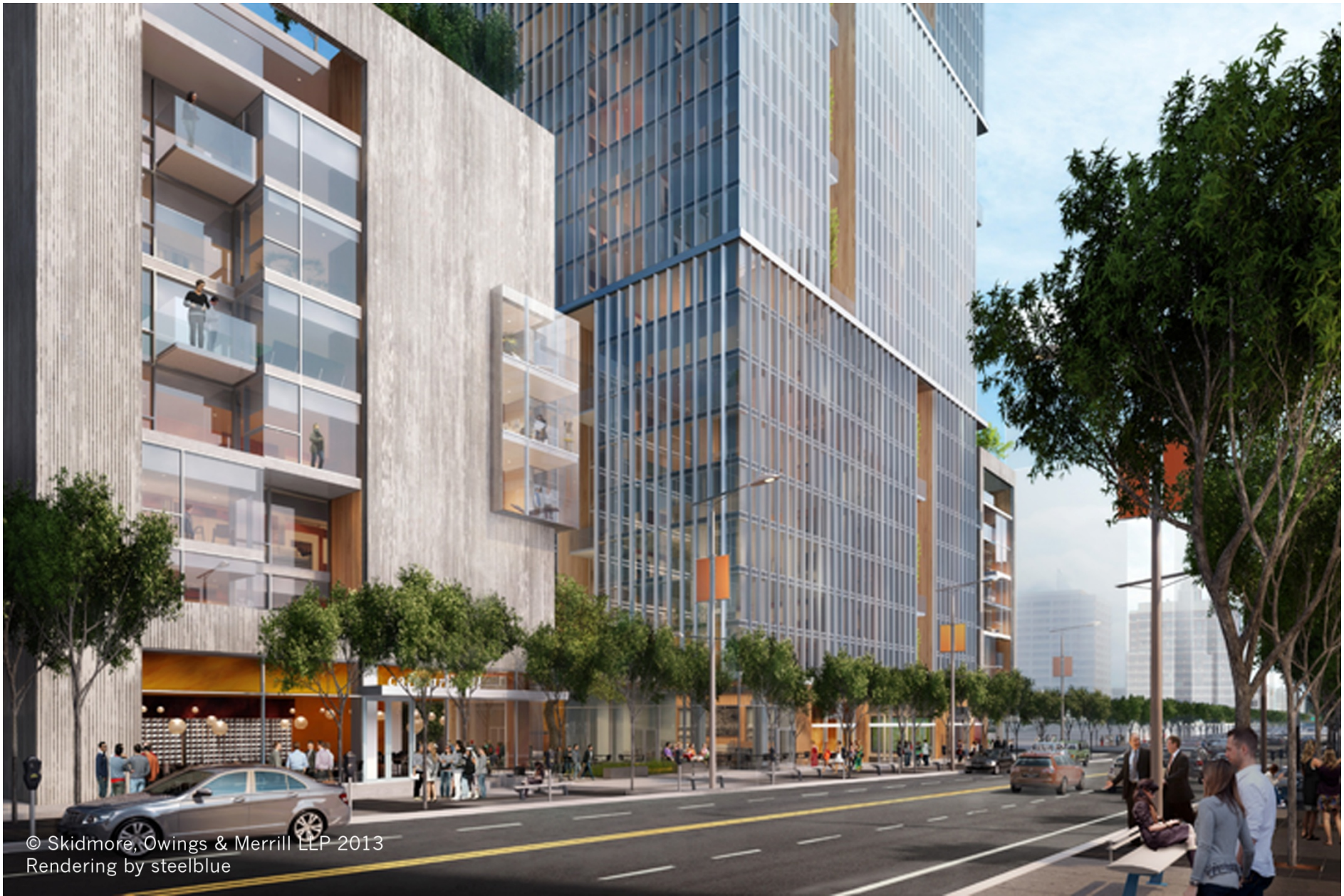
© Skidmore, Owings & Merrill LLP 2013 Rendering by steelblue