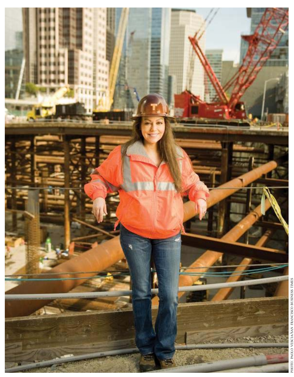
"It's almost like Whac-A-Mole. You solve one (problem) and within seconds another one comes up," says Ayerdi-Kaplan of the challenges of building the Transbay Transity Center.

The $300 million generated from the three land deals—as well as another eight