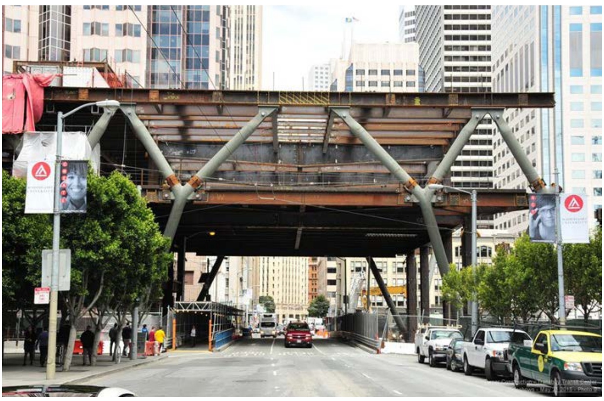
Steel crosses over First Street connecting the western and central zones of the Project.