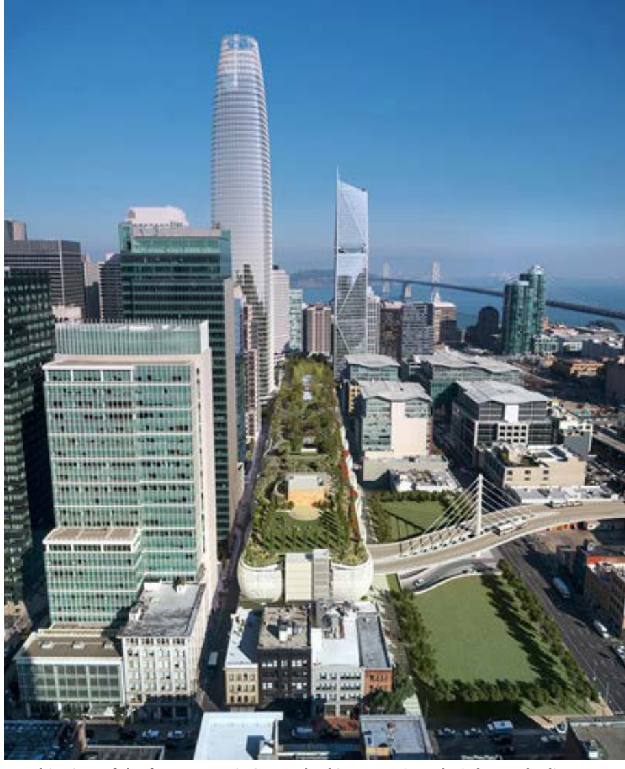
In this view of the future Transit Center, looking East, Parcel F is located adjacent to and east of the bus ramp cable stay bridge.

On September 2, the TJPA will auction Parcel F, one of only two remaining parcels slated for private highrise development in the burgeoning neighborhood around the future Transit Center. In the past, TJPA has sold parcels through a Request for Proposals process. However, strong interest from numerous developers and investors led to the decision to hold a live auction instead.